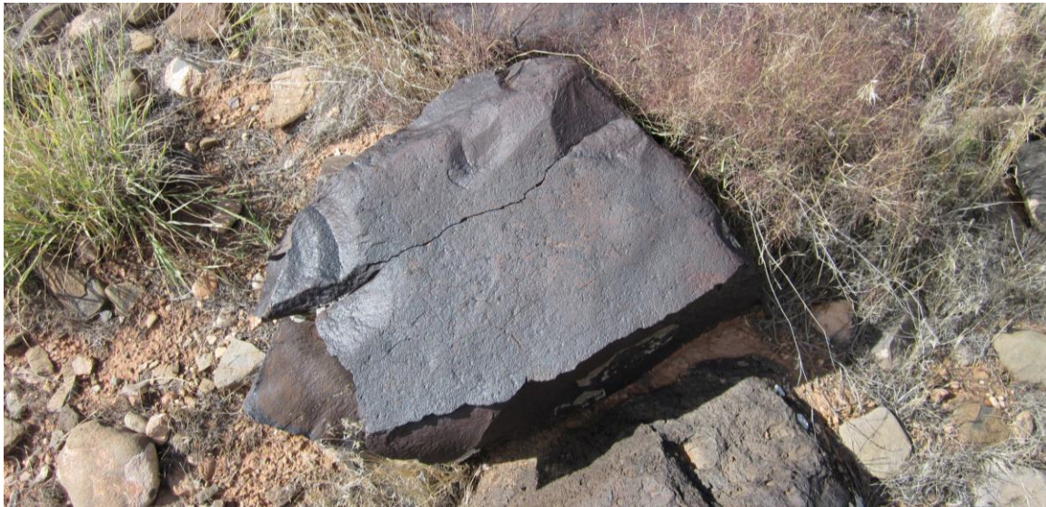
Photo of one of the rocks below...

The power at this site was the pristine nature of the rocks. It is obvious that the rocks were deemed so Sacred that it was made clear to even the children that they were not to be touched! This left an incredible impression on me. For the first time I understood that only certain rocks, boulders and cliff faces were deemed appropriate for the pecking, incising or painting, and most likely only by select members of the tribe. The other rocks were not to be touched. I have since noticed many beautiful rock surfaces that were not touched and in many cases lesser surfaces were covered with petroglyphs.